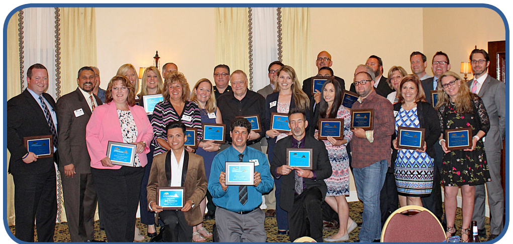
Graduates of the Class of 2017