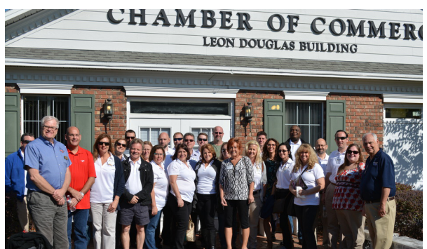
Class of 2018 Bus Tour Day 1 (East Side); Touring the Dade City Chamber of Commerce, Leon Douglas Building