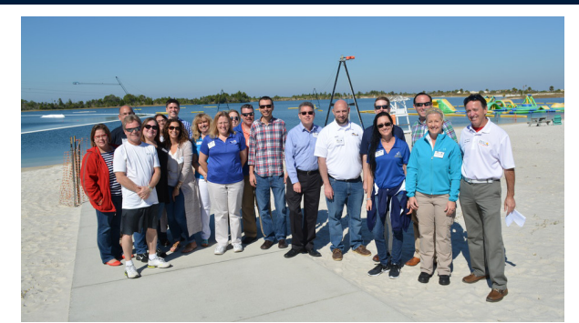
Class of 2018 Bus Tour Day 2 (West Side); SunWest Park, Hudson, Florida